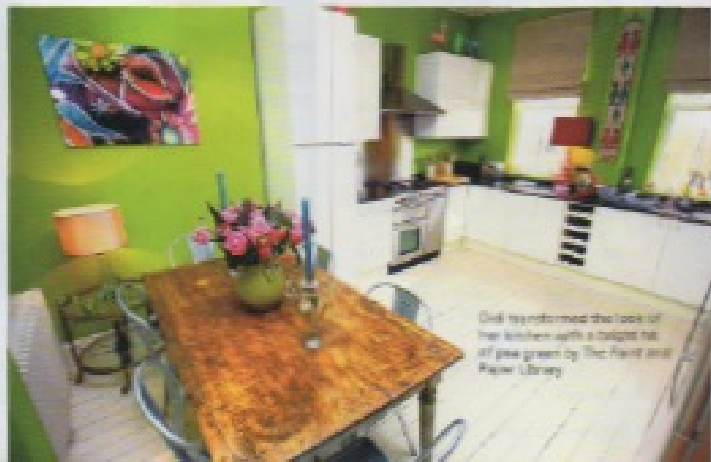
Dick transformed the look of her kitchen with a splash of all-pew green by The Paint and Paper Library